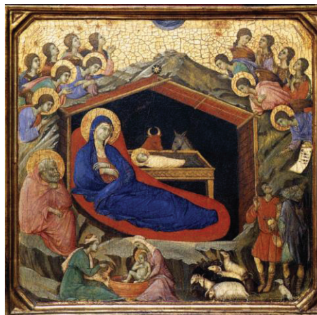
Duccio, Nativity Italian, 1308-1311 Washington, D.C., National Gallery of Art.

We are taking a look at representations of St. Joseph in art taken from imaginemdei.blogspot.com . (Continued from previous bulletin).